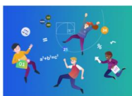
Mathematics and Numeracy