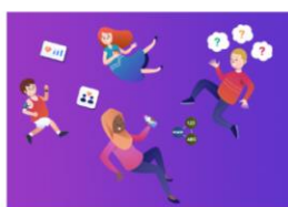
Health and Well-being