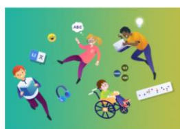
Languages, Literacy and Communication